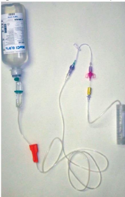
Figure 1: Assembled infusion setup including a Caresite® extension set

The applied methods demonstrate that the infusion system components tested – such as the Caresite® extension set – act as an antimicrobial barrier when used and disinfected according to instructions and guidelines.